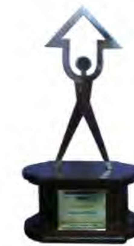
National Real Estate Award