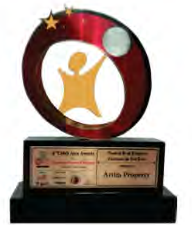
CMO Asia Award